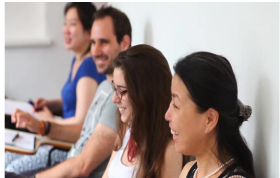
Students enjoying their class at Avalon School London